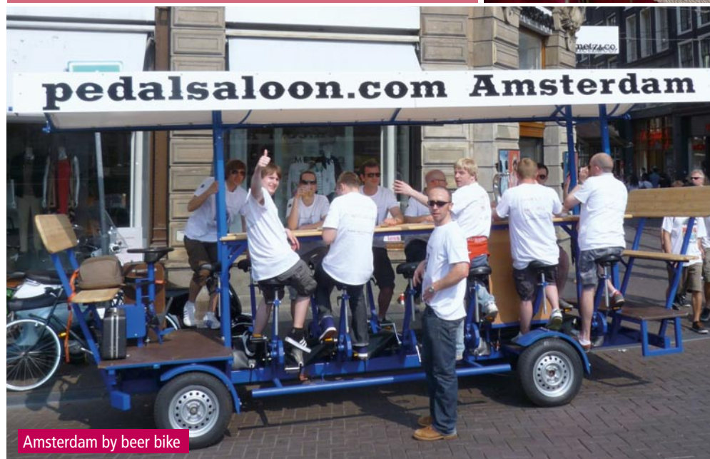
Amsterdam by beer bike