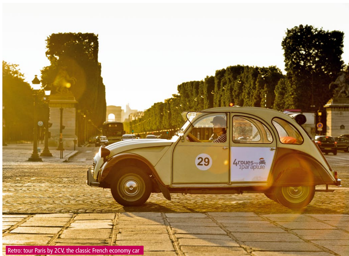
Retro: tour Paris by 2CV, the classic French economy car

WHY: A unique experience for adventure seekers – and those looking to tone up their arms. And what better way to see the floating city than from the water? »