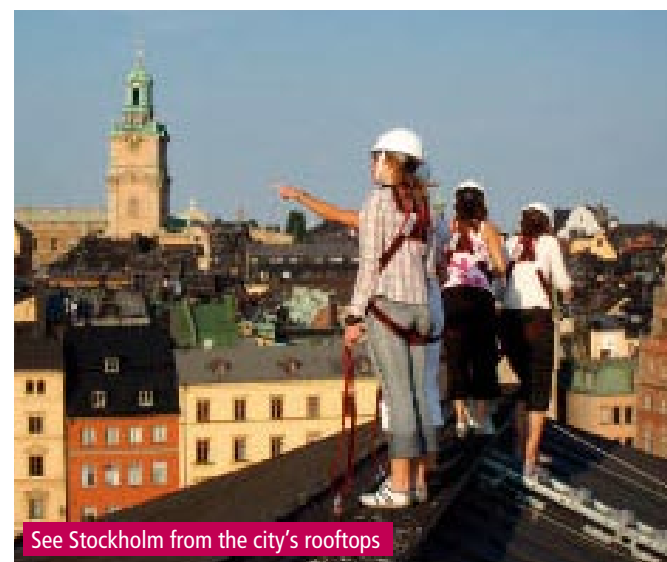
See Stockholm from the city's rooftops